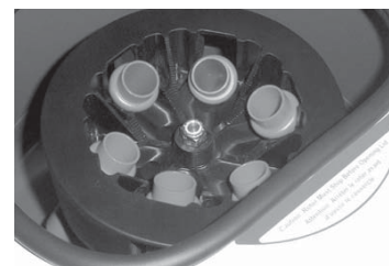
Horizontal Rotor Shown