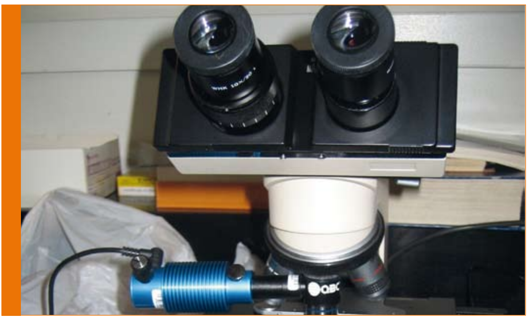
Figure 1. The ParaLens LED attachment on a traditional light microscope.

The mainstay of TB laboratory diagnosis has been the sputum smear. Since pulmonary infections with TB cause a chronic cough,